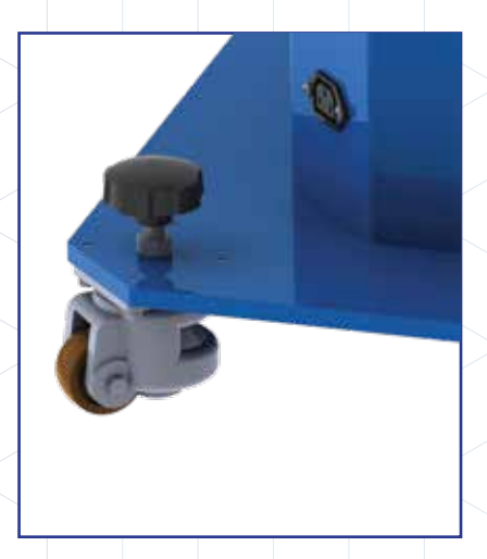
Ultra-mobile design with castor wheels