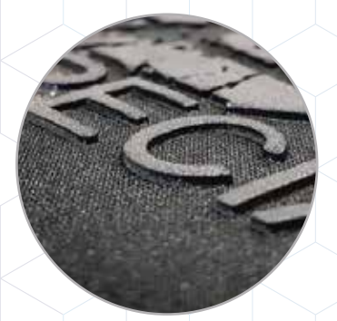
High density labels & logos for t-shirts/shirts