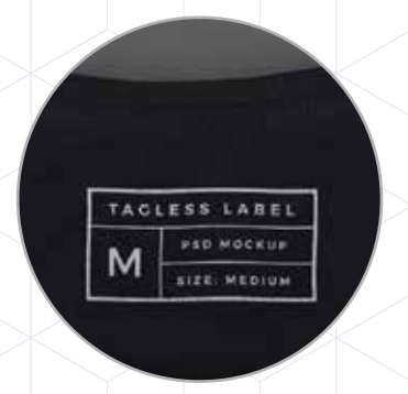
Tagless neck label