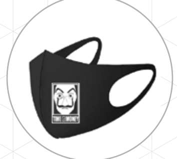
MASK & SURGICAL GLOVES