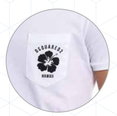
Pocket/shoulder logo printing